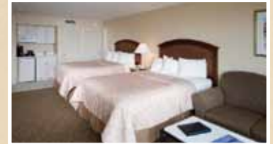
West Wing 2 Queen Efficiency (North or South View) Two Queen Pillow Top Beds or One King Pillow Top Bed, Small Refrigerator, Microwave, Sink & Single Sleeper Sofa