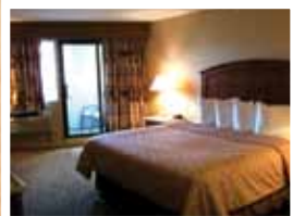
West Wing King Standard