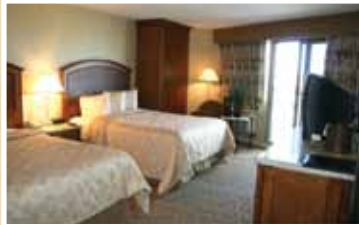
West Wing Standard (North or South View) Two Queen Pillow Top Beds or One King Pillow Top Bed, Small Refrigerator